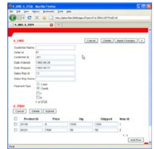
Example of an APEX module automatically migrated with PITSS.CON APEX Assistant